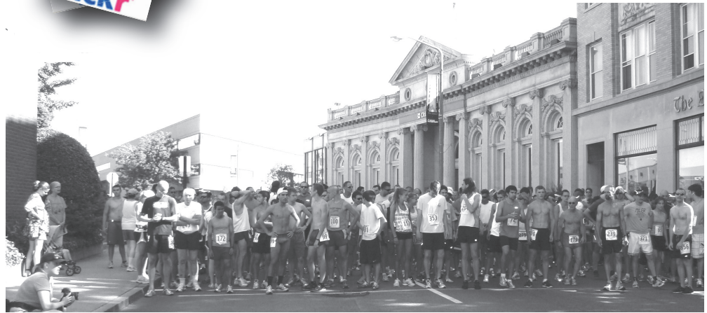
Sailfest Charter Oak 5K Road Race, July 10, 2011

We take pictures at all our events. Check out our flickr page on our website: www.ChamberECT.com/photos