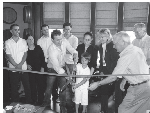
Ribbon Cutting Ceremony Buon Appetito, North Stonington