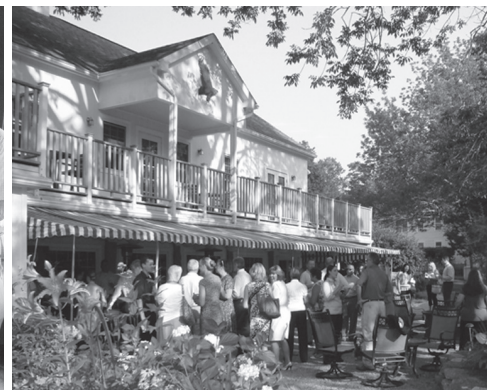
Business After Hours Stonecroft Country Inn, Ledyard