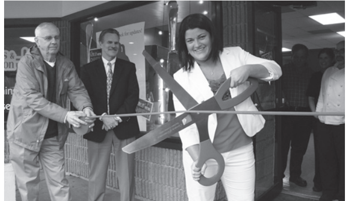
Ribbon Cutting for Ivy's Simply Homemade in Waterford.

At the Chamber of Commerce of Eastern Connecticut our sole purpose is quite simple: to promote our members. We work daily to create a supportive atmosphere to allow you to succeed as a business. The Chamber is your voice in the region.