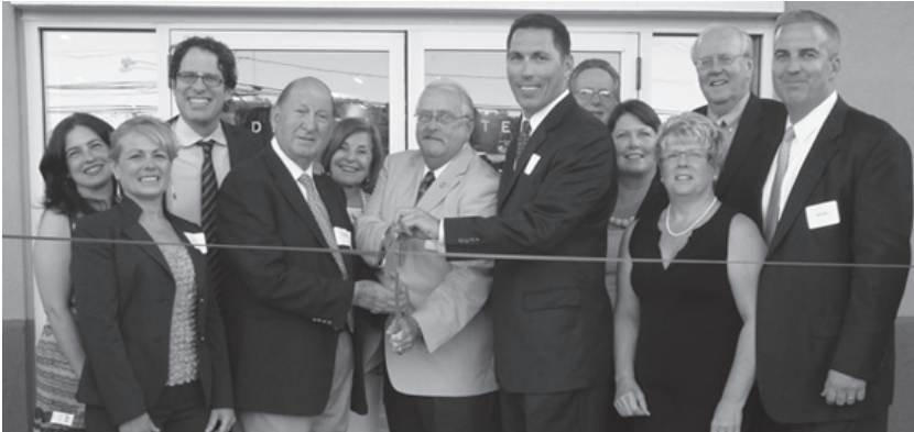
Grand Opening of LaZboy Furniture in Groton.