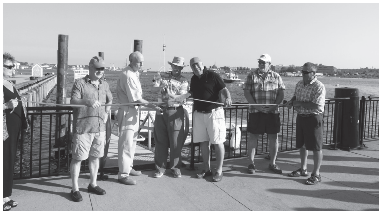
Ribbon Cutting Ceremony Mooring Fields, New London