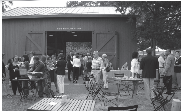
Business After Hours at Florence Griswold Museum

We take pictures at all our events. Check out our flickr page on our website: www.ChamberECT.com/photos