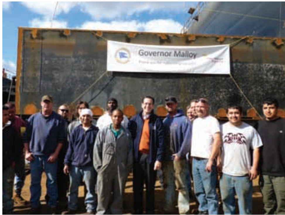
Above: Governor Malloy visiting with employees from Thames Shipyard in New London. The Governor met with Cross Sound Ferry Services and Thames Shipyard last month from a campaign promise to improve New London's port system.

We not only support our members locally, we are your voice in Hartford when it is necessary to support or oppose legislation being proposed there. In addition, we monitor national business news and related government activities and act as a communication vehicle for news and information that could directly affect your business.