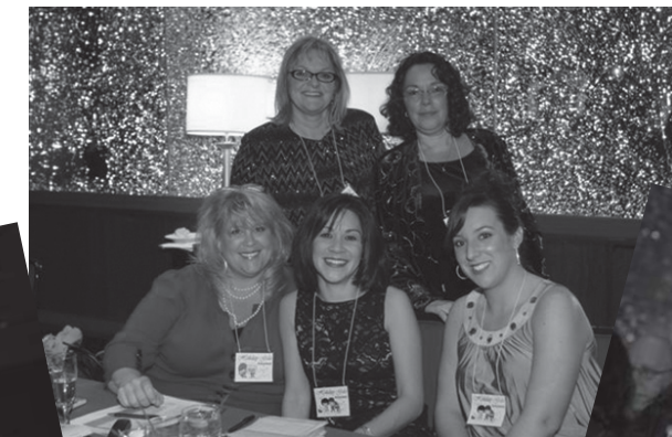
Holiday Gala Volunteers